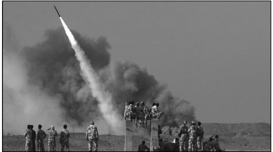
Iranian Republican Guards Corps tests mid-range missiles.

This reckless adventurism by the Zionists is out of sheer desperation. The Zionist economy is facing possible collapse, internal political divisions are rife, and yet they have come no closer to eliminating the Palestinian Re-